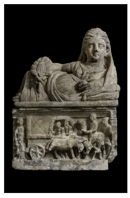
Cinerary urn with lid : journey of the deceased on a chariot (late 2<sup>nd</sup> - early 1<sup>st</sup> century BCE)