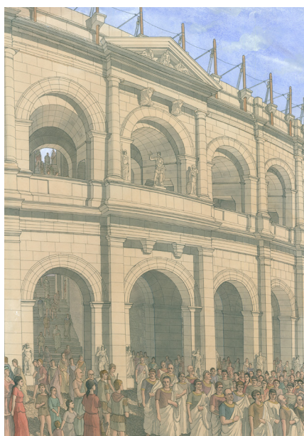
© Ville de Nîmes - Jean-Claude Golvin